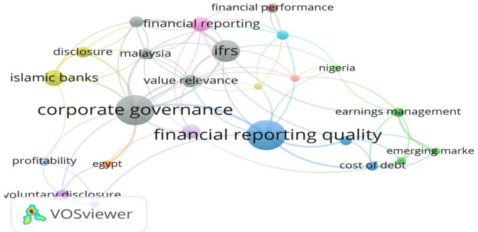
Figure 1 , analysis of CO-OCCURENCES OF ALL KEYWORDS